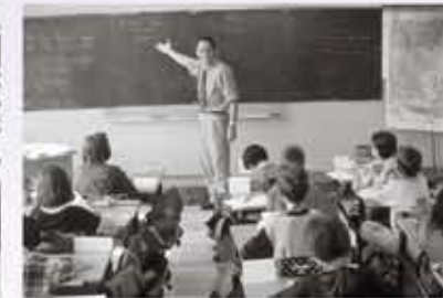
"THE IMPACT OF FORCED DISPLACEMENT ON SCHOOL ENROLLMENT IN COLOMBIA"