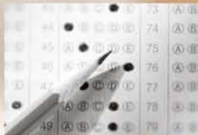
"EXAMINATION OF ADVANCED PLACEMENT INCENTIVE PROGRAM"