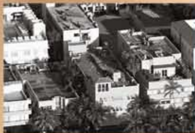
"FORMALIZING URBAN PROPERTY RIGHTS IN LATIN AMERICA: IMPACTS AND EVALUATION"