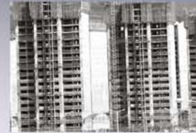
"THE LOW-INCOME HOUSING TAX CREDIT: REINFORCING THE WALLS OF RESIDENTIAL SEGREGATION? AN EMPIRICAL ANALYSIS OF CHICAGO"