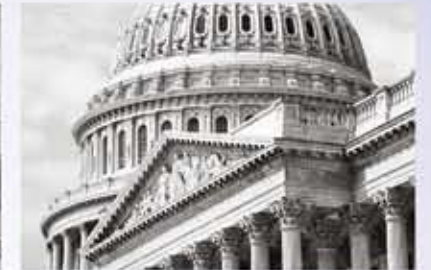
"ILLEGAL MIGRATION FROM MEXICO TO THE UNITED STATES: AN ECONOMIC APPROACH"