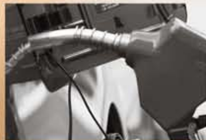
"GAS TAXES, DRIVER RESPONSE, AND CAR EXTERNALITIES"