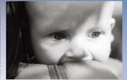
"CLIENT TRANSITIONS IN A CHILD WELFARE AGENCY"