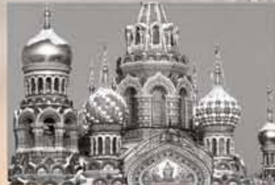
"POLICY OF CENTRALIZATION IN RUSSIA: INCENTIVES, THREATS, PROSPECTS"