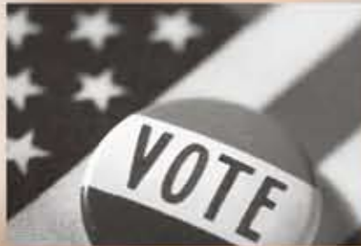
"DEMOCRACY AS A MARKET: POLITICAL DEMAND AND POLICY OUTCOMES IN REPRESENTATIVE GOVERNMENT"