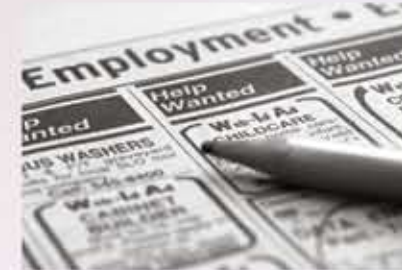
"DEPRESSION AND ITS CORRELATES IN THE CONTEXT OF MIDDLE CLASS JOB LOSS: A MIXED METHODS ANALYSIS"